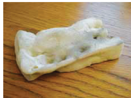
Several Uses - Discard