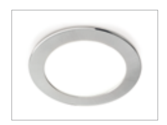
SATIN NICKEL (code 17)